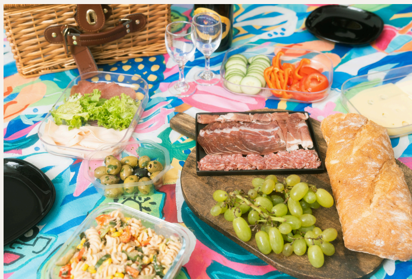
Luxury picnic setup service

The goal is to create something people would enjoy participating in.